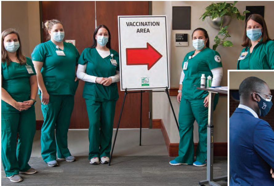
LEFT: NMC NURSING STUDENT VOLUNTEERS