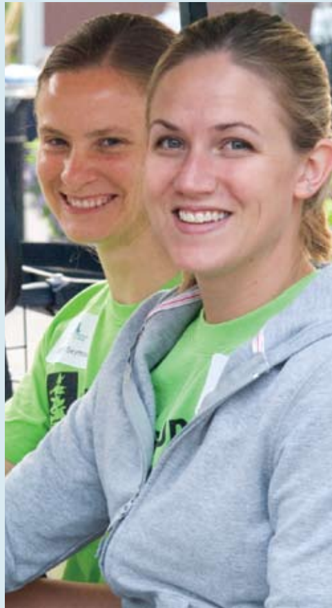
Grateful recipients of NMC scholarships lend a hand at the 2007 NMC Scholarship Open, which raised more than $76,000. Sponsors and players are wanted for this year's tournament – call (231) 995-1021.

This year, NMC's Annual Campaign raised $330,000 – its largest goal ever – and attracted 70 new donors.