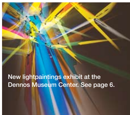
New lightpaintings exhibit at the Dennon Museum Center. See page 6.