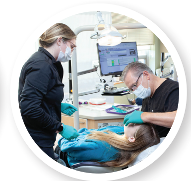
Summer internships are required. NMC helps coordinate 2 office location experiences