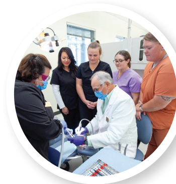
Dedicated dental lab at NMC's Front Street Campus Health & Science Building

Quicker entry into the workforce for students seeking a stable and fulfilling career.