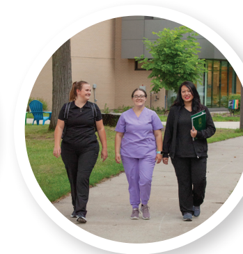
Small class sizes provide help & support. The program takes up to 24 students per semester