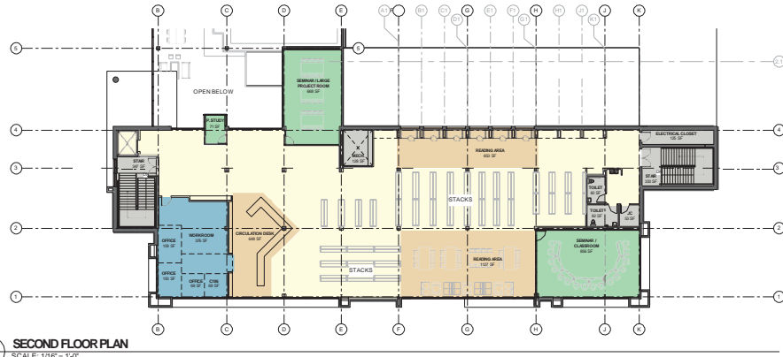
SECOND FLOOR PLAN SCALE: 1/16" = 1'-0"