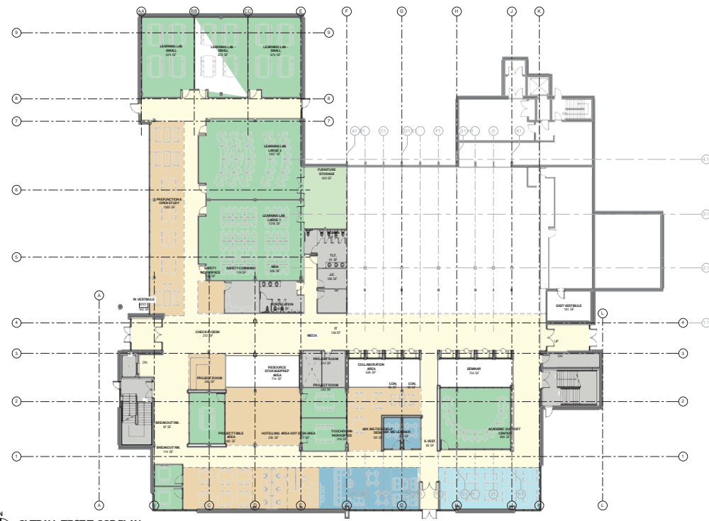
OVERALL FIRST FLOOR PLAN SCALE: 1/16" = 1'-0"