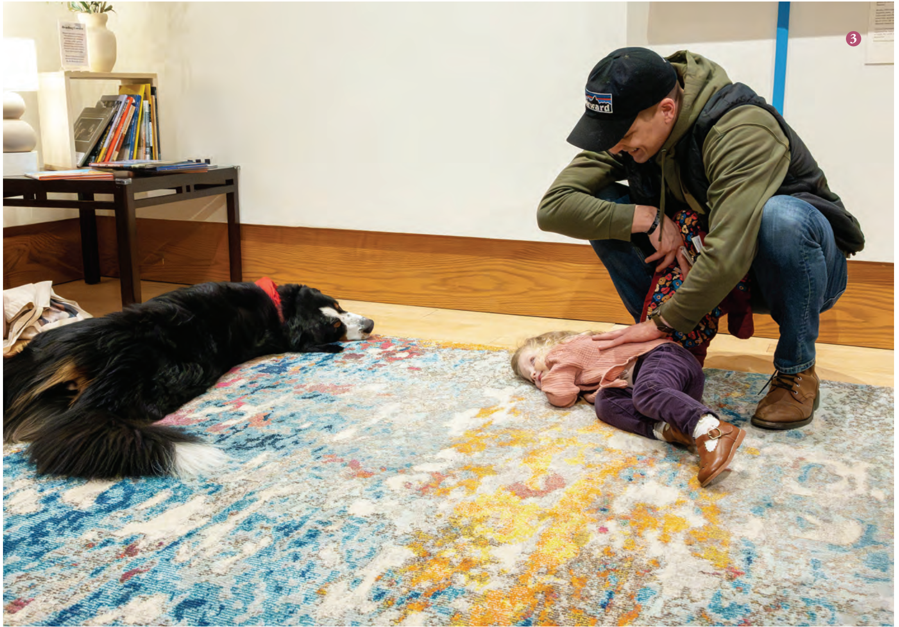
3 On a busy free day, Rosie the therapy dog was at the museum to help children relax during storytime.