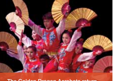
The Golden Dragon Acrobats return to Milliken Auditorium Oct. 12. See p. 4.